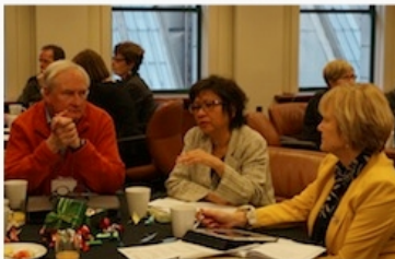
Library Directors in Conversation at BC ELN All Partner Meeting