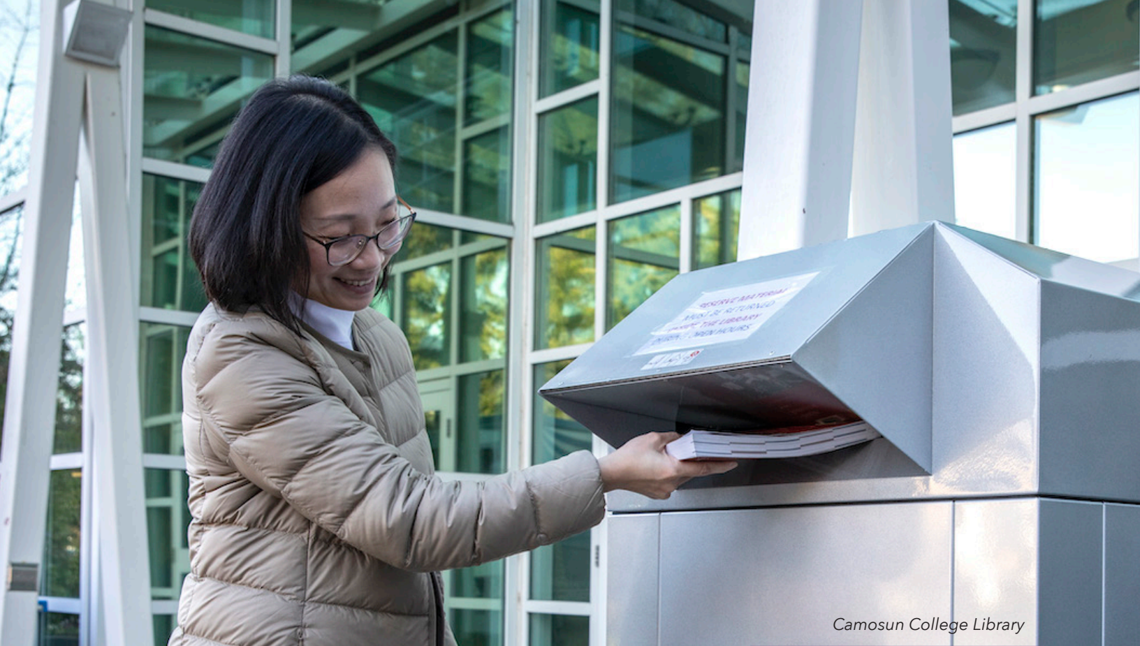
Camosun College Library