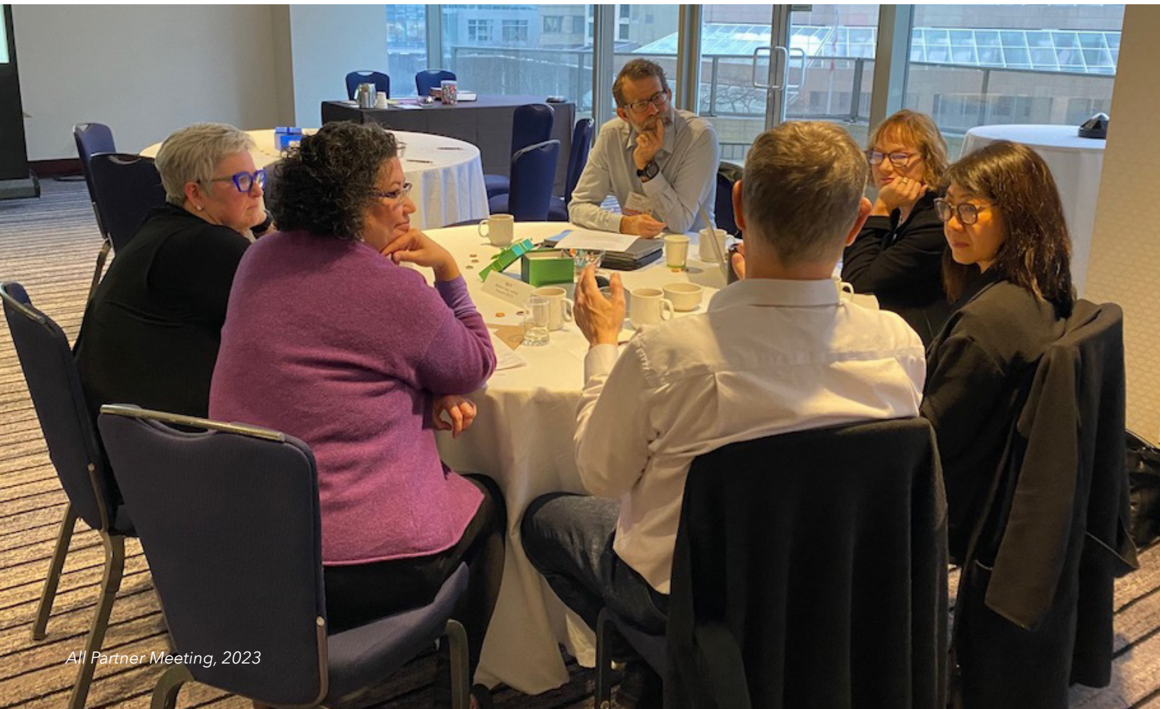
All Partner Meeting, 2023

Each December BC ELN brings all partner library directors together to discuss issues of importance for the group. In 2023, the All Partner Meeting focused on building future-ready libraries with conversations on Artificial Intelligence and Indigenization.